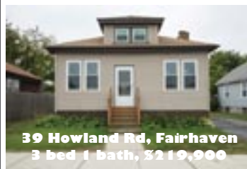
39 Howland Rd, Fairhaven 3 bed 1 bath, $219,900