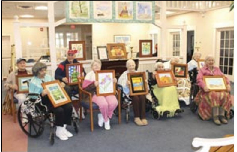
Alden Court and Rehab Center senior artists proudly display their artwork at Southern Mass Credit Union. Submitted photo.

Mass Credit Union is a full service community credit union headquartered in Fairhaven with branch offices located in New Bedford and Fall River. For additional information on credit union membership, services or products, contact Southern Mass Credit Union at 508-994-9971 or visit southernmass.com.