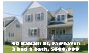
40 Balsam St, Fairhaven 3 bed 2 bath, $699,999