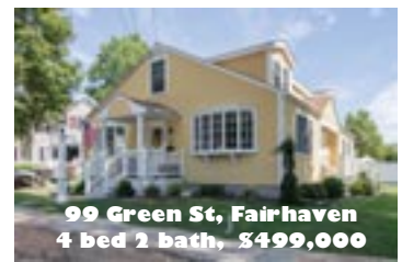
99 Green St, Fairhaven 4 bed 2 bath, $499,000