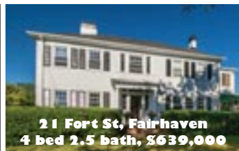
21 Fort St, Fairhaven 4 bed 2.5 bath, $639,000