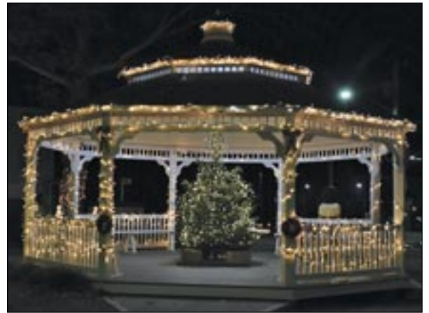
The gazebo at Benoit Square in Fairhaven will be lit up every night until the January.

The lights in the square are on every evening until January.