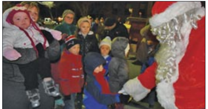
These photos were taken at the Town Hall Sing-Along on Saturday, 12/10. See page 13 for more.