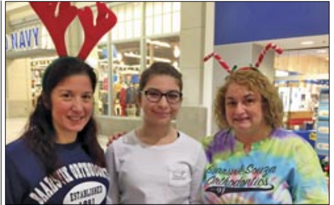
Baarsvik Souza Staff and friends support The Women's Center's 15th annual Wrapping for a Cause fund-raiser at the Dartmouth Mall last week.