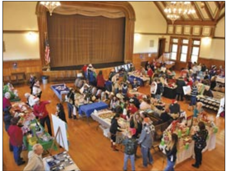
ABOVE LEFT: The Boy Scouts set up shop selling hot chocolate and sweets outside of Town Hall in Fairhaven for the Old-Time Holiday event on Saturday, 12/10. ABOVE RIGHT: The town hall shops featured only non-profit organizations selling all manner of fun stuff in the auditorium upstairs. BELOW LEFT: The Friends of the Millicent Library organized a Book Fair featuring local authors. BELOW RIGHT: The Unitarian Memorial Church's Holiday Marketplace featured this table with Holiday Greens.