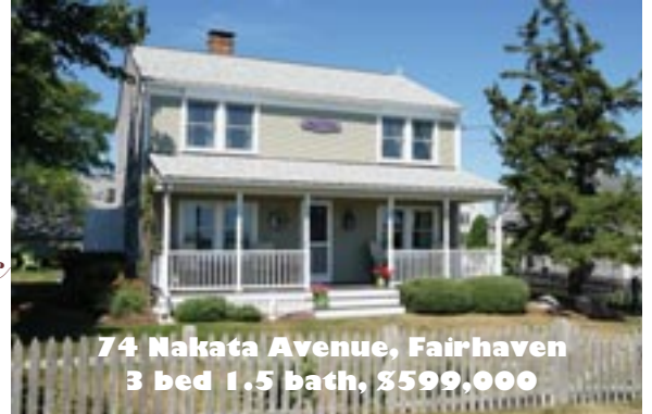
74 Nakata Avenue, Fairhaven 3 bed 1.5 bath, $599,000