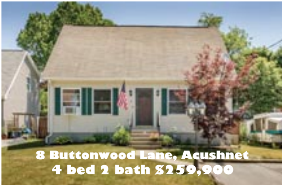
8 Buttonwood Lane, Acushnet 4 bed 2 bath $259,900