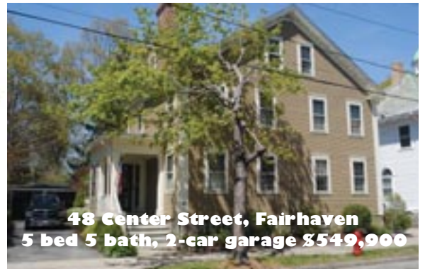
48 Center Street, Fairhaven 5 bed 5 bath, 2-car garage $549,900