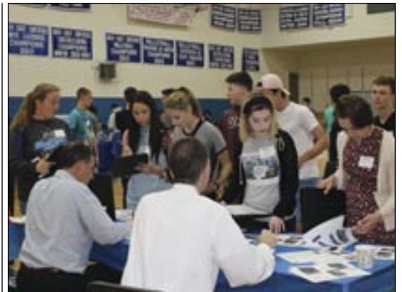
Fairhaven High School students visit vendors during the recent CU 4 Reality Fair sponsored by Southern Mass Credit Union. Submitted photo.

Southern Mass Credit Union is headquartered at 123 Alden Road in Fairhaven with offices located at 2926 Acushnet Avenue in New Bedford, 1101 Stafford Road in Fall River and branch offices located inside Fairhaven High School and Plymouth North High School (available for students, faculty and staff). SMCU is a full service community credit union with approximately $204 million in assets and 14,380+ members. The credit union offers a variety of competitive savings, checking, mortgage and loan products. For more information on credit union membership, services or products call 508-994-9971 or go online at southernmass.com.