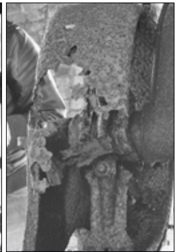
BELOW: The Rogers School Bell was cast in 1885. ABOVE: Two angles of the corroded cradle. The bell will be removed on Saturday at 10 a.m. Committee members hope to have it re-installed after getting the cradle rebuilt.