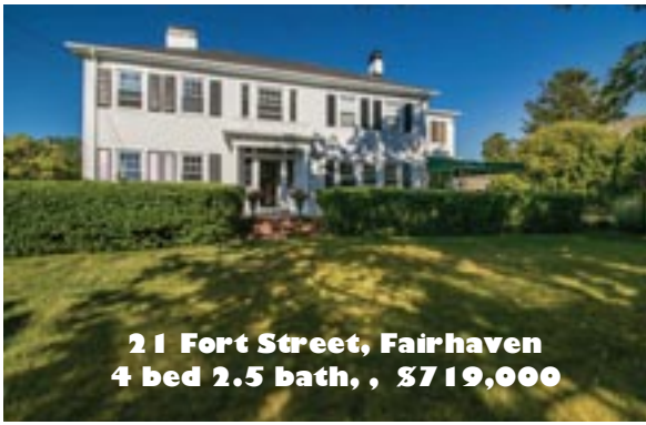
21 Fort Street, Fairhaven 4 bed 2.5 bath, , $719,000