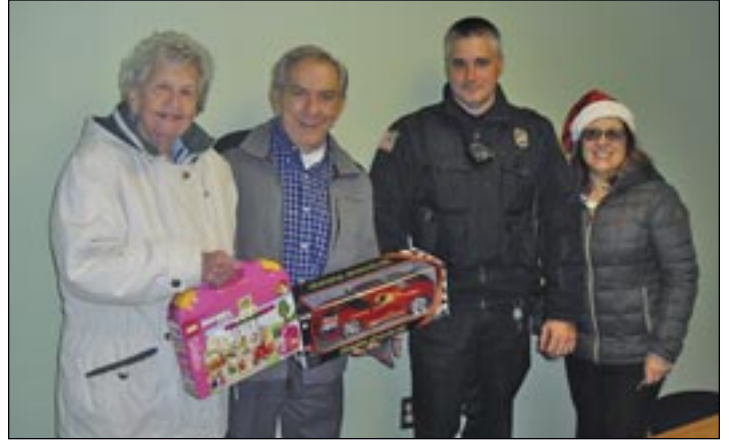
Our Lady's Haven residents and staff were so happy to spread the Christmas spirit with our Fire and Police Departments by providing the stations with breakfast, lunch and supper to offer our sincere thanks for their service to our Fairhaven Community. Toys were also happily donated to Toys for Tots. Merry Christmas from Our Lady's Haven!!!