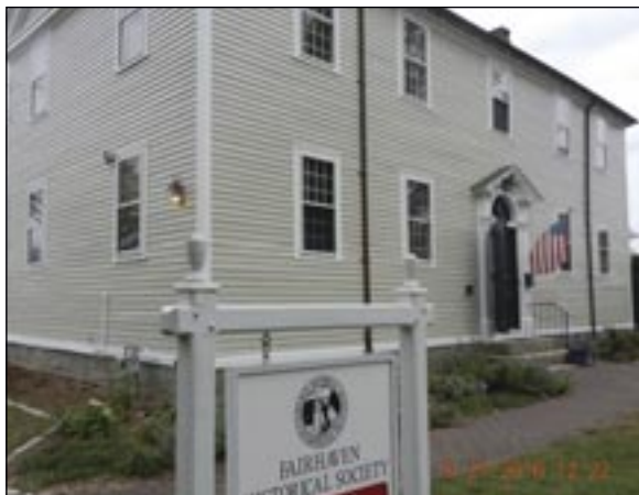
L-R: Before and after pictures of the Academy building, which houses the Fairhaven Visitors Center and Historical Society Museum.