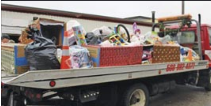
ABOVE AND TOP: Toys collected by the Iron Order of the Silent Few motorcycle club fill a flat-bed truck to transport to the Salvation Army on December 18.

we are plumbers, truck driver, electricians, masons, laborers and Law enforcement. We want everyone to feel comfortable when we walk into your establishment with our 'colors' on, to feel free to come ask us about our club. We love and are very proud of our club and would love to speak to people about what we do."